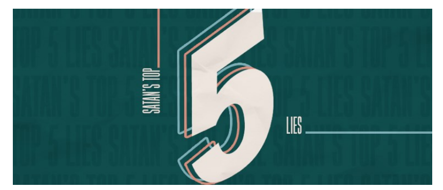
Lie #4 God Wants Me to be Happy All the Time June 19 - 20, 2021

The Big Lie: God wants me to be happy all the time.